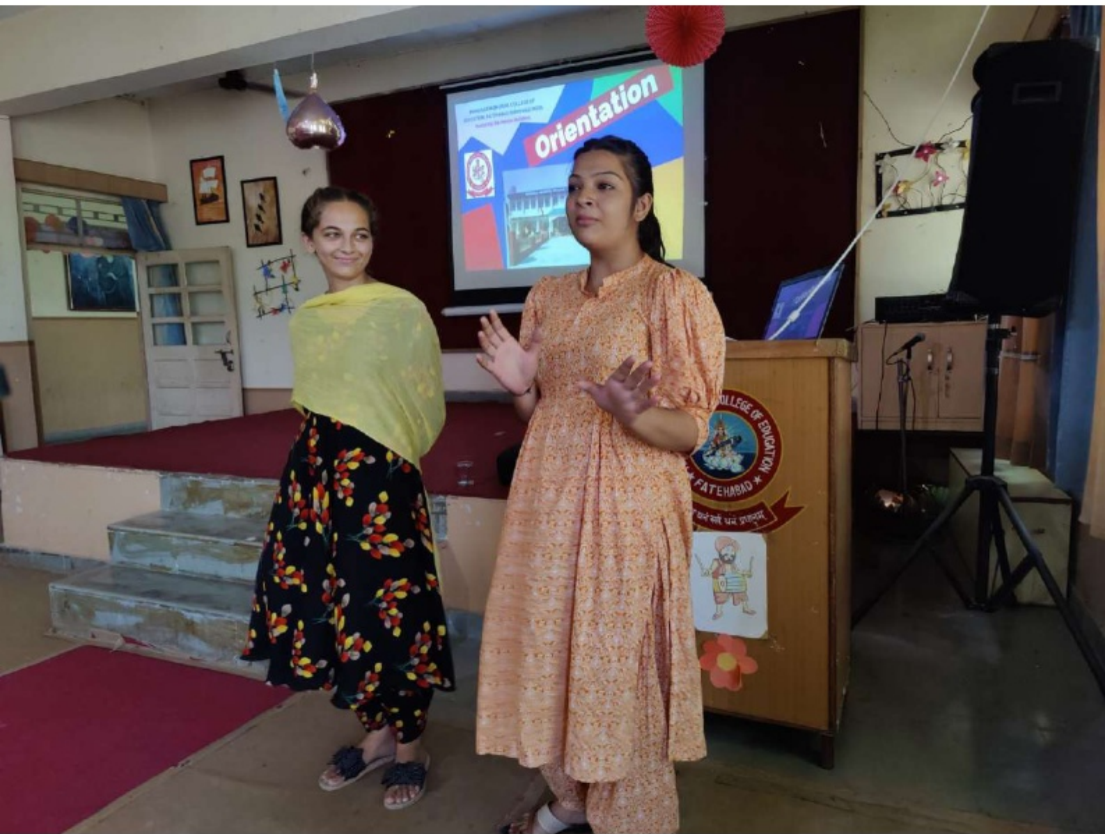
Student Induction Programme 28-11-22 & 29-11-2022