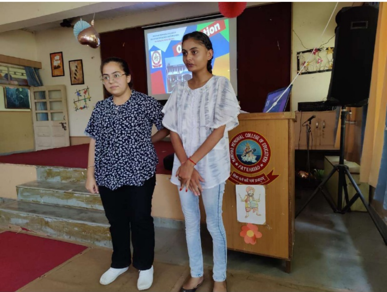
Student Induction Programme 28-11-22 & 29-11-2022